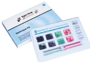
Super-Snap X-TREME Technique Kit [REF 0508]