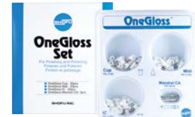
OneGloss Set [REF 0180]