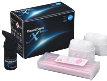
BeautiBond Xtreme Set [REF Y2448]