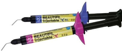
BEAUTIFIL Injectable X/SL