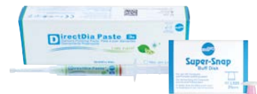
DirectDIA Paste [REF 0558] & Super-Snap Buff Disks [REF L523/L524]