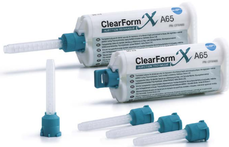
ClearForm X Set [REF CFXA65] 2 x 50 ml cartridges 8 mixing tips (Green)