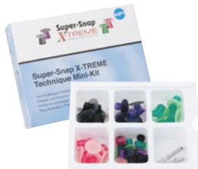
Super-Snap X-TREME Technique Mini-Kit [REF N0509]